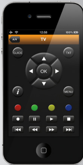
TV widget second page