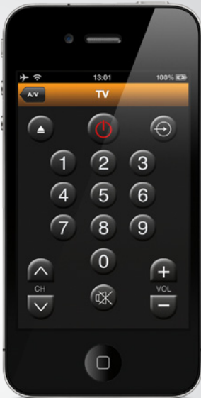
TV widget First page